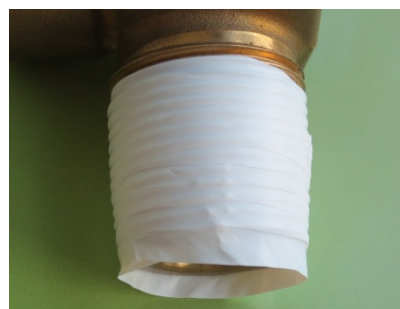
Figure 3 Typical example of excessive PTFE tape applied to the valve inlet thread