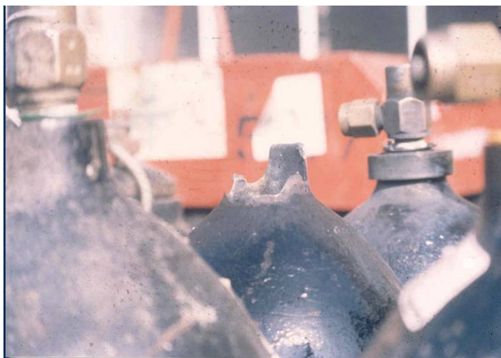
Figure 1 Burnt out cylinder neck and valve

Use of PTFE sealant that is not oxygen compatible can lead to burn-out of the neck of oxidising gas cylinders under ignition conditions (see Figure 1).