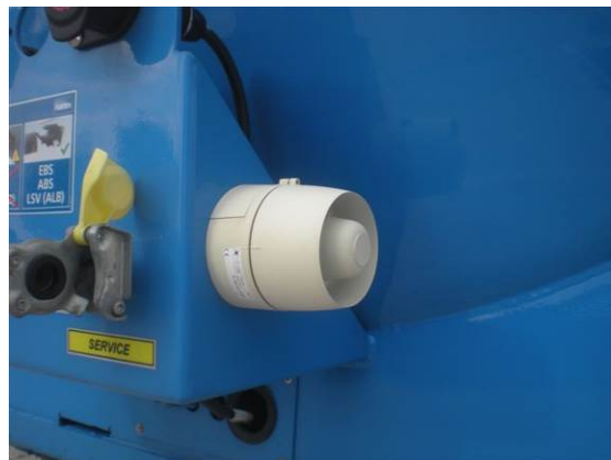
Figures B-3 Visual and acoustic warning signs