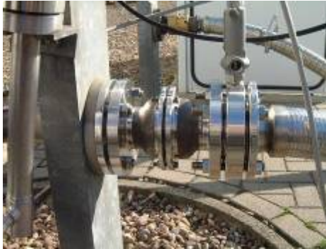
Figure 1 Typical breakaway coupling for liquid filling

Breakaway couplings are passive devices that are fitted at the fill point between the stationary pipe-work and flexible transfer hoses used for filling or discharging tankers with liquid product. Figure 1 shows a typical installation for tanker filling.