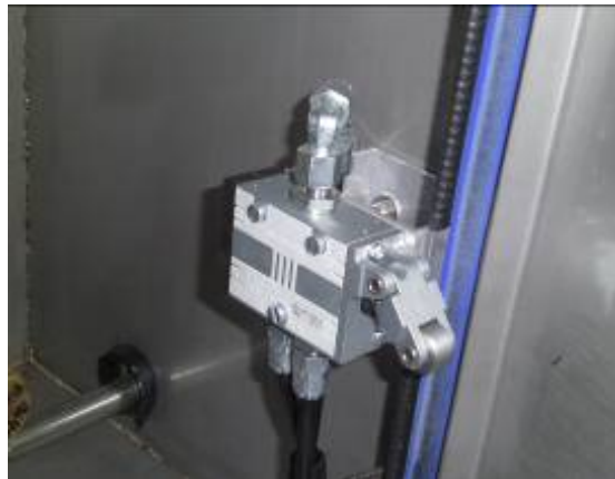
Figure B-2: Interlock with braking system active when cabinet door is opened