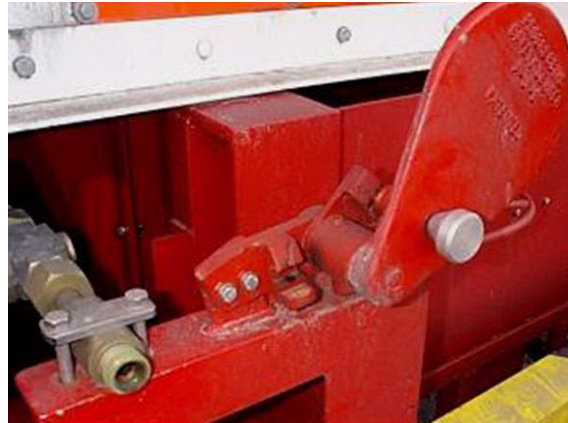
Figure B-1: Tow-away incident prevention device blocking the coupling when activated