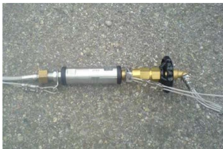
Figure 2 Typical breakaway coupling for gaseous filling

A breakaway coupling may be used for gaseous products, which consists of a hose with two spring loaded valves at either end that are held open under normal operation by a wire, see figure 2. In the event of a tow away the wire parts and the valves close.