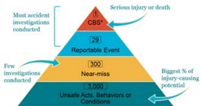
Incident Ratio Model: Adapted from Heinrich's Theory - https://www.rmfi.harvard.edu/Blog/2018/August/Leveraging-the-largest-patient-safety-learning-engine

More information on human behaviours within transport operations can be found in the TS 07 Human Behaviour within Transport Operations [3].