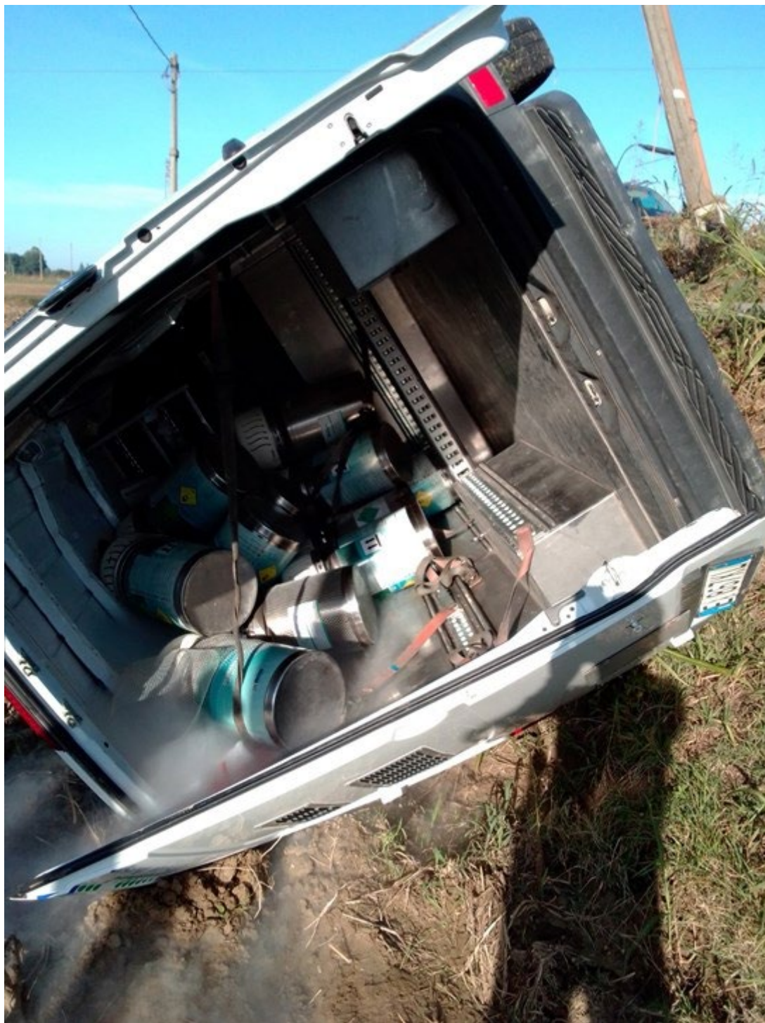
Figure 9 Rollover incident

The public shall not be allowed to enter the area where there has been an oxygen spillage until it has been determined that all of the gas has been dispersed.