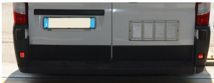
Figure 1 Typical ventilation grill at the bottom of the rear door on delivery vehicle

It shall not be possible to close off these vents and the cargo being carried on the vehicle shall not be allowed to block off the ventilation openings.