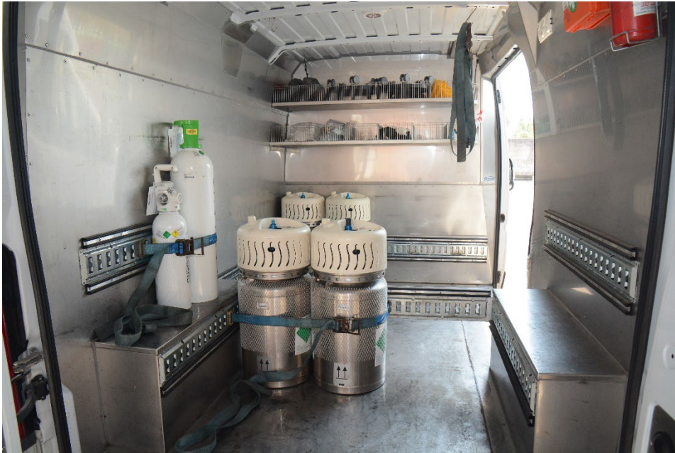
Figure 4 Typical segregation of base units with full and empty cylinders secured separately