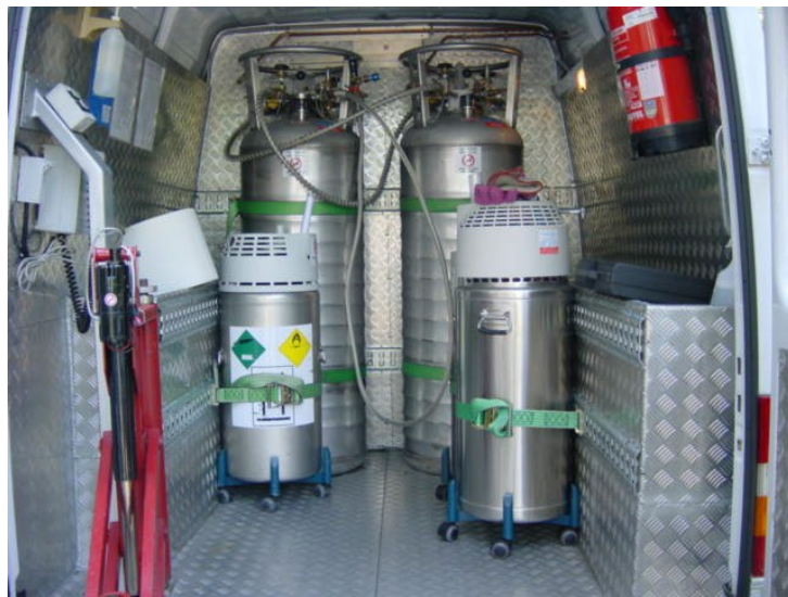
Figure 3 Typical liquid cylinder storage and security systems on delivery vehicle

All other equipment, disposable items and spare parts for the equipment shall be securely stored to prevent them moving and damage during transport.