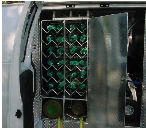
Figure 2 Typical cylinder storage rack on delivery vehicle

If cylinders are transported horizontally, they shall not be able to move inside the compartment during transportation. An example of a cylinder rack is given in Fig. 2.