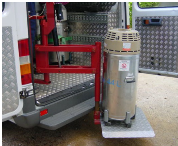
Figure 7 Example of a lift for loading and unloading a base unit of the vehicle

Cryogenic vessels can only be carried inside elevators when they are not venting.