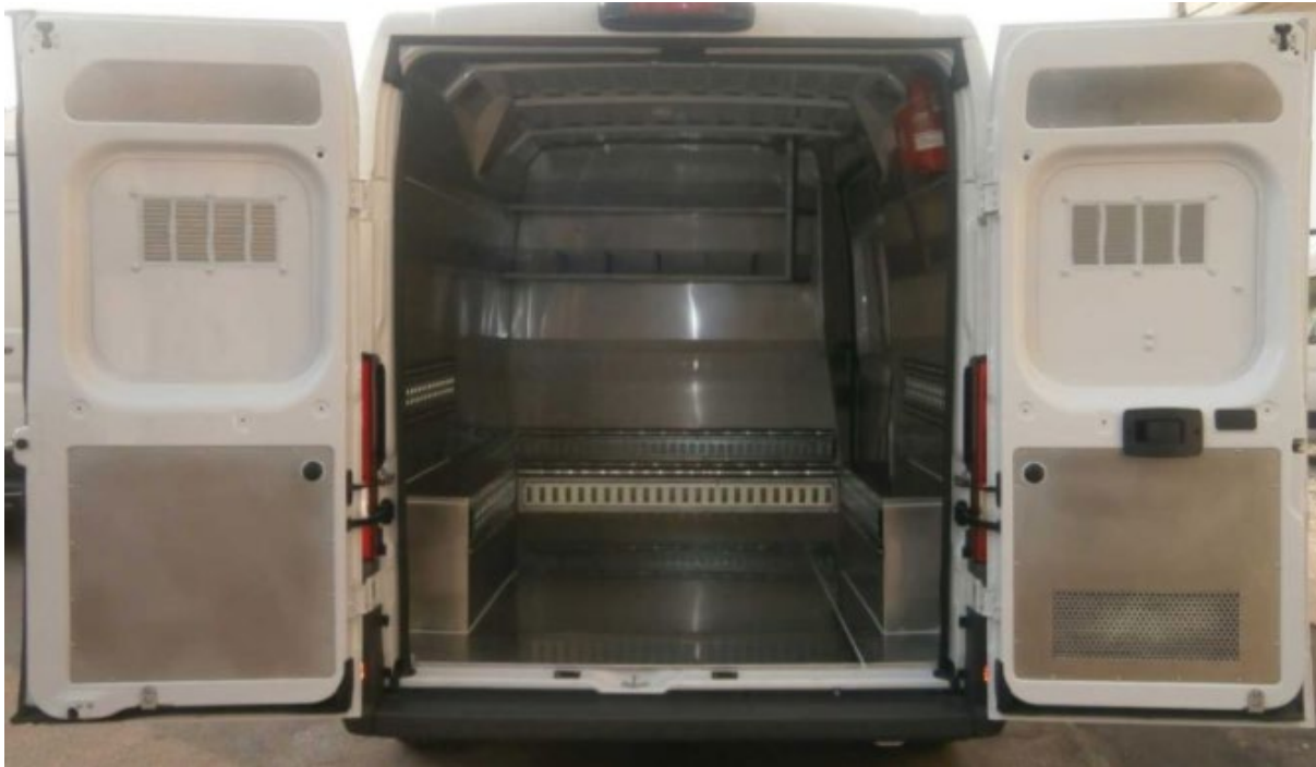
Figure 5 Examples of homecare delivery vehicle used for supplying full for empty